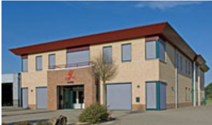
XYZTEC's head office in The Netherlands

XYZTEC, incorporated in 2000, designs and manufactures innovative equipment that is used for quality assurance to ensure the reliability of many products in multiple industries. We set the standard in Statistical Process Control (SPC). We are 100% focused on bond testing and have established our name as technology leader in bond testing worldwide.