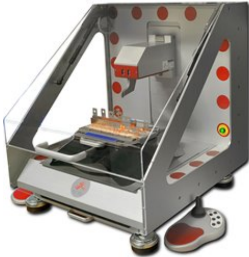
Condor 150-4 HF with safety guards