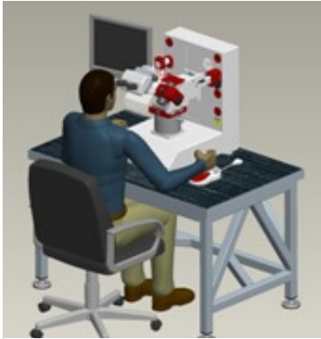
Ergonomic view Condor Classic 3D