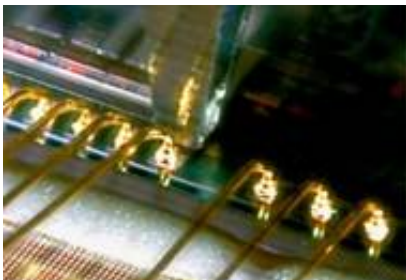
Figure 1: shear testing of gold ball bonds within a semiconductor device

A good example of this is shear testing of a gold ball bond and wire bonds within a semiconductor device (Figure 1). A good gold ball bond will be stronger than the ball so the failure mode of a strong bond will be gold ball shear. It is not uncommon for production engineers to use this failure mode alone as an indication of bond strength but it does represent a limit to the capability of the test. A better test would produce a bond failure and record a higher force that corresponds with the bond strength. One of the prime objectives of a bond test designer is to try to produce the failure mode of interest.