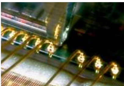
Figure 1: shear testing of gold ball bonds within a semiconductor device

A good example of this is shear testing of a gold ball bond and wire bonds within a semiconductor device (Figure 1). A good gold ball bond will be stronger than the ball so the failure mode of a strong bond will be gold ball shear. It is not uncommon for production engineers to use this failure mode alone as an indication of bond strength but it does represent a limit to the capability of the test. A better test would produce a bond failure and record a higher force that corresponds with the bond strength. One of the prime objectives of a bond test designer is to try to produce the failure mode of interest.