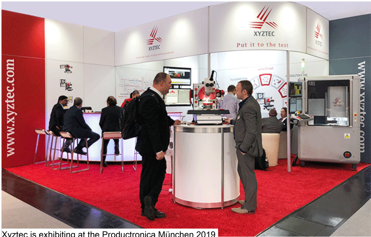
XYZTEC is exhibiting at the Productronica München 2019