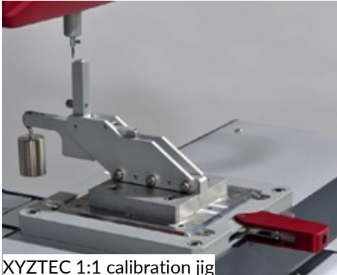
XYZTEC 1:1 calibration jig