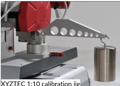
XYZTEC 1:10 calibration jig

All XYZTEC sensor modules come fully tested and calibrated, ready to use. Each sensor has its own electrical module that stores all of its force and temperature calibration data together with other information like the type of sensor, range, serial number, etcetera.