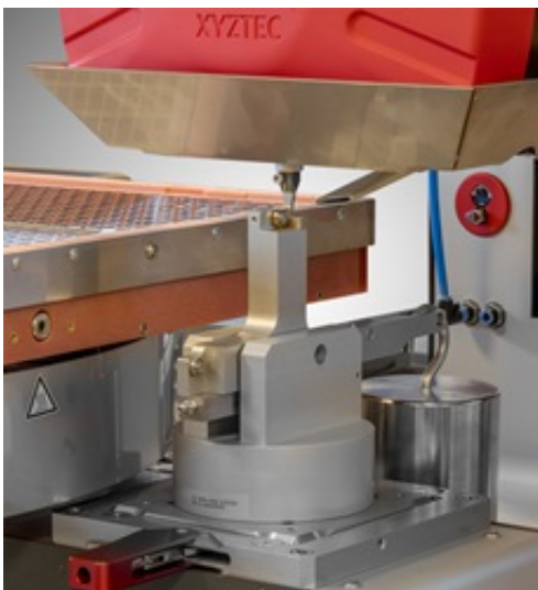
1:2 calibration jig fitted next to a large heater workholder. The customer does not need to remove the workholder in order to calibrate the bond tester

The XYZTEC jigs are manufactured to the highest possible precision and use high quality ball bearings at every pivot and load application point. A simple and intuitive wizard ensures calibrations are done easily and accurately. Alternatively, we offer calibration of our sensors by another load cell, in the form of a Chatillon. All such calibrations can be customized from simple to complex to suit your needs.