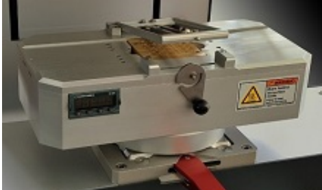
Heater workholder (up to 500°C) mounted on the Sigma by quick release system

To obtain a reliable, reproducible measurement one needs more than only the precise Condor equipment. At a similar level of importance comes the way the sample is fixed on the Condor equipment during testing.