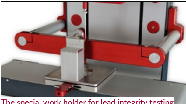
The special work holder for lead integrity testing

Another common work holder is the universal clammer with customized mask and inlay which is specially designed for lead frame applications. Last but not least, XYZTEC also offers the very clean designed heated object work holder, with built-in PID temperature controller and heating block, which can go up to 500°C easily and can be equipped with various customized inlays.