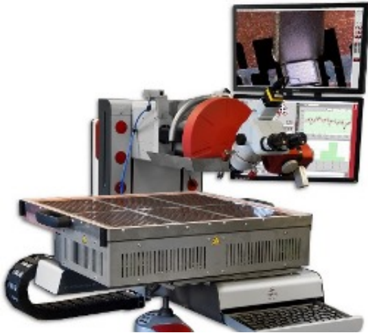
The market leading Condor Sigma W12, equipped with a rotating 13500W 518x513mm heater stage

Another common work holder is the universal clammer with customized mask and inlay which is specially designed for lead frame applications. Last but not least, XYZTEC also offers the very clean designed heated object work holder, with built-in PID temperature controller and heating block, which can go up to 500°C easily and can be equipped with various customized inlays.