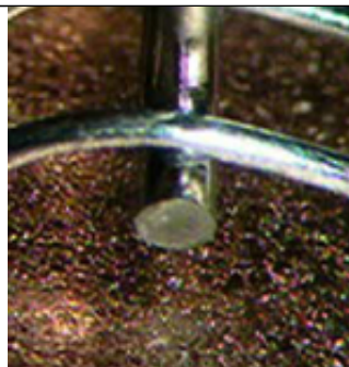
Thick aluminium wire pull test