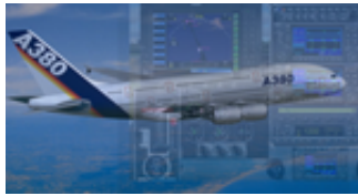
Avionics in Aircrafts