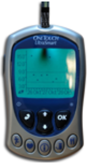
Blood sugar level measurement equipment