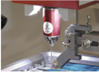
Peel test on Solar cell