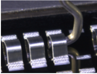
Ribbon pull pull test