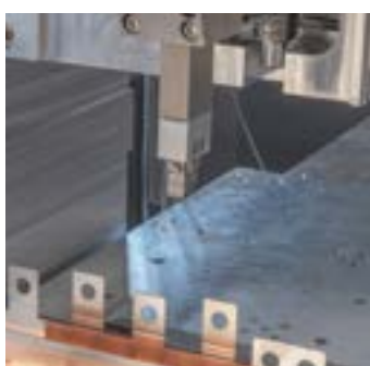
Exceptional system stiffness of 0.1 mm per 1000 kgf