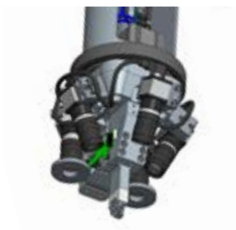
Most rigid test head in the industry with up to five perpendicular cameras