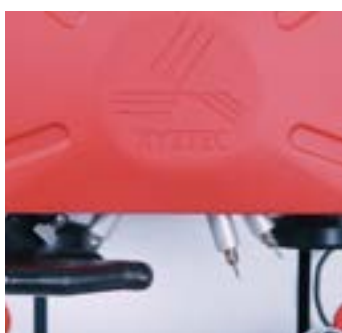
Six sensors RMU, up to 200 kgf: Changing cartridges manually no longer required