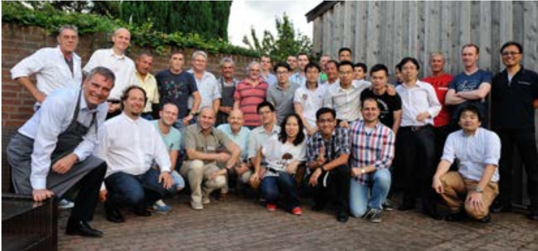
XYZTEC's international team for sales and service and our international offices