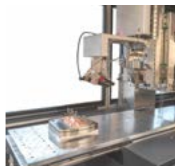
Large working area

The Sigma HF's system stiffness of 0.1 mm / 1000 kgf tool to work holder sets a new standard in tester rigidity. High tool to sample positional accuracy enables automation of the most complex circuit architecture. Bond strength is measured with an accuracy of \pm 1\% .